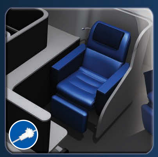
SMART MOTION SYSTEMS