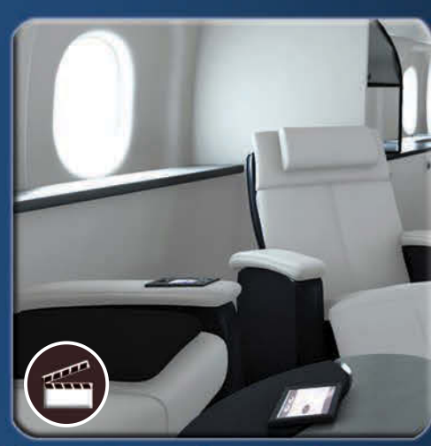
SMART IFEC & CMS SYSTEMS