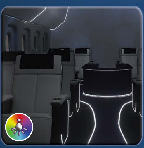
SMART LIGHTING SYSTEMS